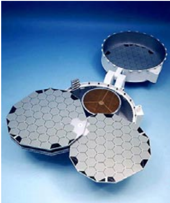
Rocketstar Robotics' engineers developed the Array Deployment Actuator for the Genesis project to sample the solar wind