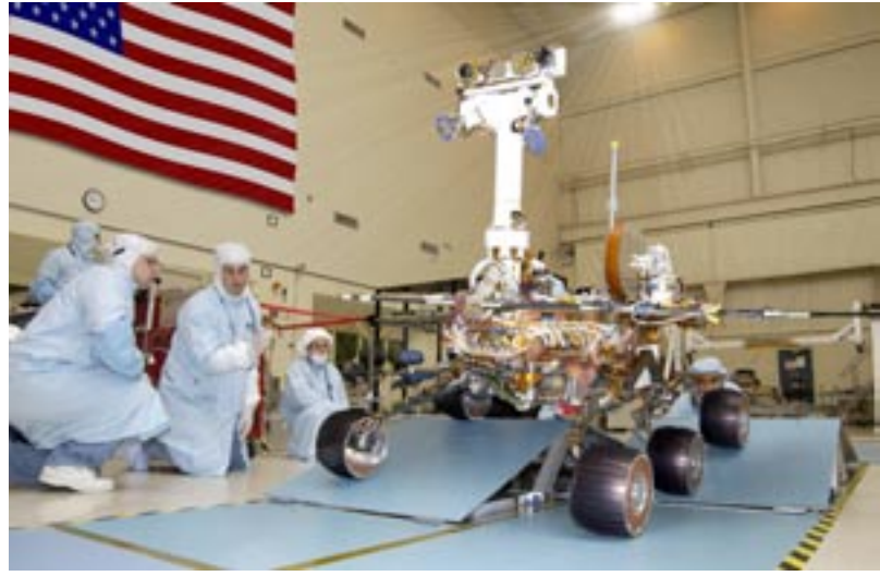
Rocketstar Robotics' engineers have been responsible for the design of more than 50 mechanisms and gearboxes on the Mars Exploration Rovers Spirit and Opportunity and they have all performed well beyond expectations

Rocketstar Robotics design, analysis, and manufacturing capabilities provide exceptional performance and value. Our engineering team is well versed in the all disciplines of actuator and mechanisms design including; gear design, motor design, static and dynamic stress analysis, thermal analysis and tribology.