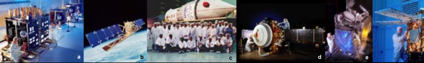
Rocketstar Robotics' engineers have been responsible for the design and manufacture of motors, gearboxes, actuators, gimbals, camera pointing mechanisms, deployment systems, and robotic manipulators. They are just a few of the many spacecraft they have contributed to including: (a) Global Positioning Satellites, (b) Radarsat I and II, (c) Sirius Satellite Radio, (d) Genesis, and (e) Mars Reconnaissance Orbiter.