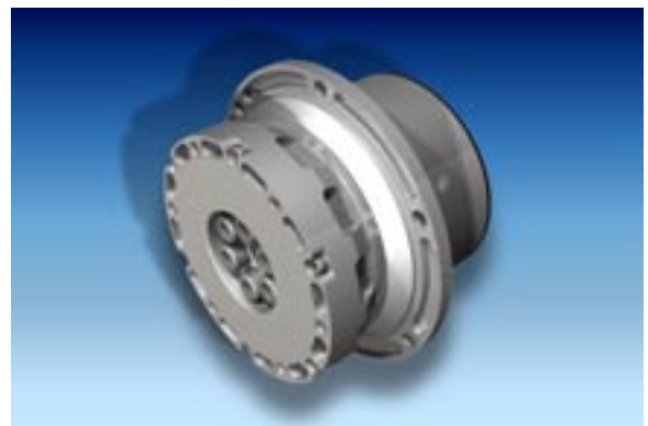
Rocketstar Robotics' High Specific Stiffness Harmonic Drive Rotary Actuator for camera and antenna pointing mechanisms, solar array drives and robotics applications