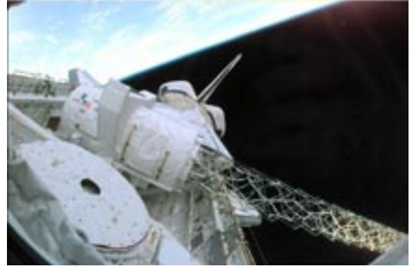
Rocketstar Robotics engineers designed deployment actuators for the Shuttle Radar Topography Mapper, the largest deployable structure ever flown

Some of our areas of expertise include but are not limited to: