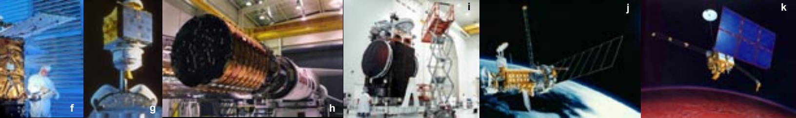
deployment systems, suspension systems, robot arm actuators, instrument mechanisms and solar array drives for dozens of spacecraft applications. Presented here (e) Koreasat, (f) Orbview 3 & 4, (g) Satcom K1-K4, (h) Orbcomm, (i) A2100 and A2100M, (j) DMSP, (k) Mars Observer, and (l) Mars Pathfinder.