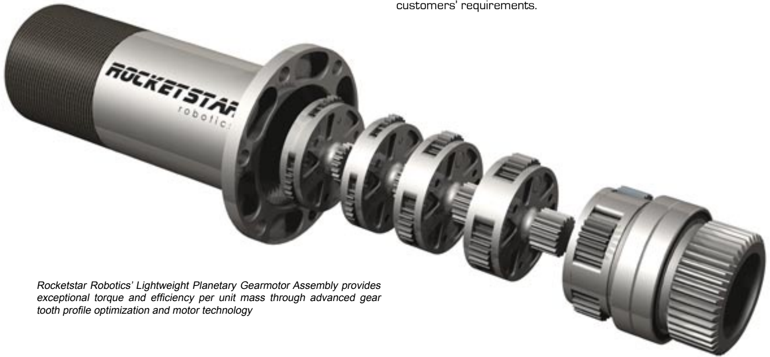
Rocketstar Robotics' Lightweight Planetary Gearmotor Assembly provides exceptional torque and efficiency per unit mass through advanced gear tooth profile optimization and motor technology

Prior to starting Rocketstar Robotics our engineers have been responsible for the design and manufacture of numerous high profile spacecraft mechanisms and actuators. In addition, they have been called upon on multiple occasions to serve as consultants to several spacecraft and spacecraft mechanisms suppliers including the Jet Propulsion Laboratory. From Earth orbit, to Mars and beyond our team is ready to support our customers' requirements.